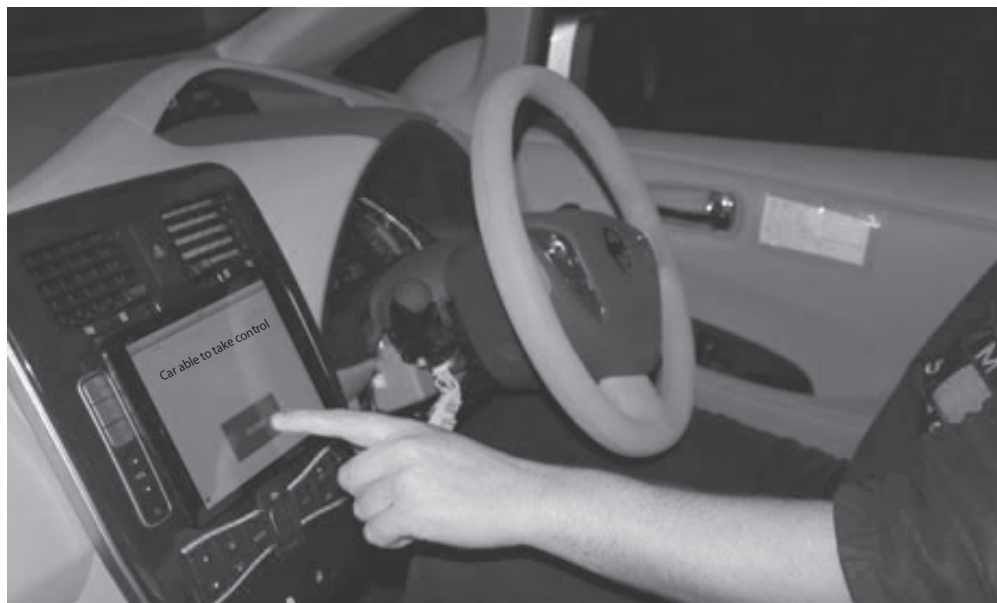
Figure 4: Control panel of a self-driving car